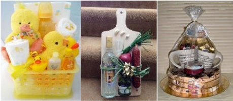
BABY BATH CHARCUTERI COFFEE

Below are a few ideas for making gift baskets. These may be used as is, or as starter themes for you to create your own.