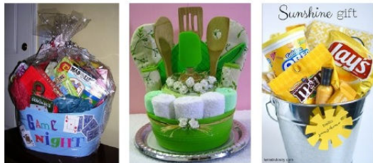
Game Night Green Kitchen Sunshine