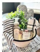
Just for Her

Please bring your baskets to the Lodge by Friday June 16 th or to the car show by 12:00 PM.