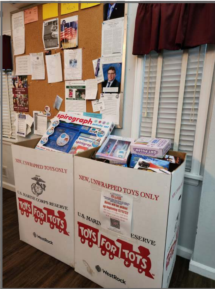
TOYS FOR TOTS ... TWO LARGE BOXES FILLED TO THE BRIM WITH TOYS