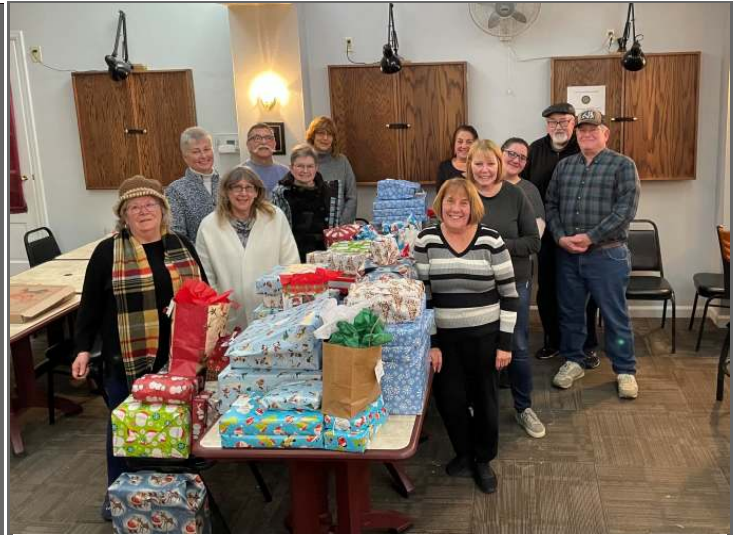
Scotia Glenville lodge # 2759 completed the holiday Adopt a Family project. We were able to provide gifts of toys, clothing, household essentials and grocery gift cards for 3 families in our community. Wrapping party was held December 12.