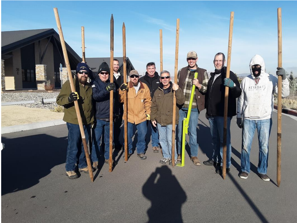
On December 18, 2021, Sparks Elks members and volunteers assisted the Northern Nevada State Veterans Home with removing about 200 tree posts. It only took about 2 hours to finish.