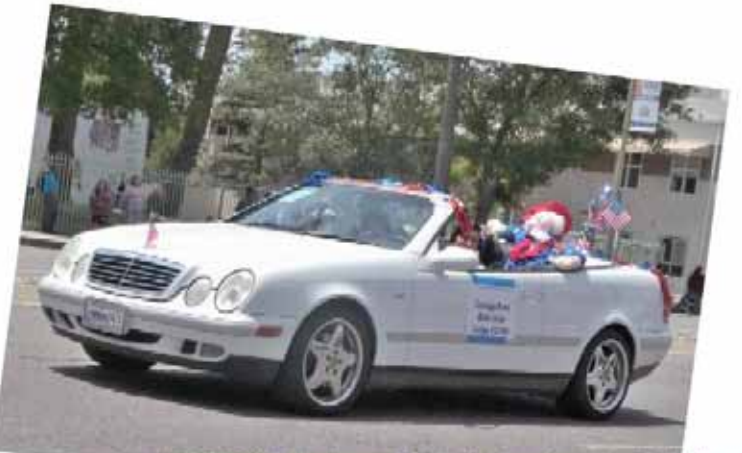
Canoga Park Memorial Day parade May 26 2025 Canoga park Elks lodge2190 participants