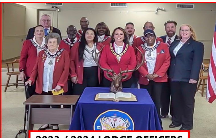
2023 / 2024 LODGE OFFICERS