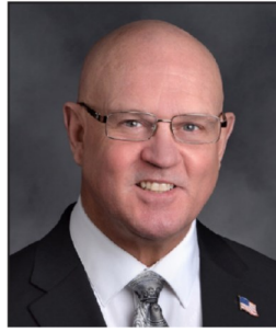
Message from the Grand Exalted Ruler

May has many events that we as Elks are proud to recognize and participate in. Let's start with Mother's Day, which this year falls on Sunday, May 14. Thank you to each Lodge that has a Mother's Day celebration. You may want to consider assembling a committee and starting an event if your Lodge has never had one. Mother's Day is a very special day to spend not only with your mother but your