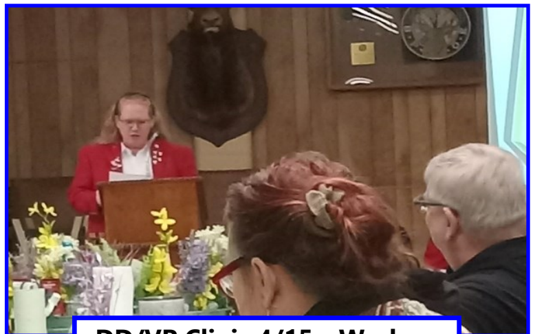
DD/VP Clinic 4/15—Weslaco