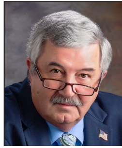
Message from the Grand Exalted Ruler

We did it. We finished. The retiring Officers deserve the thanks of all the Members for the successful way in which they have handled their duties in the past year. The work that was accomplished is a tribute to their leadership and effort. It is our hope they will continue to assist the incoming Officers with the work in which our Order is engaged.