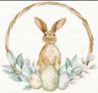
BRUNCH WITH THE BUNNY

Bunny Brunch Buffet on Saturday, April 4th from 11a - 2p - The Lounge and Bar will be open @ 11a.