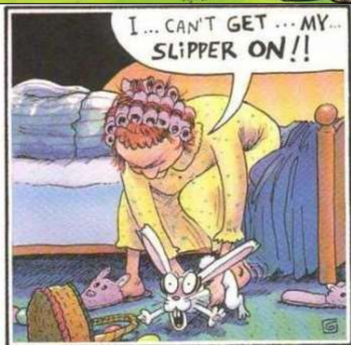
THE EASTER BUNNY GETS A RUDE AWAKENING.