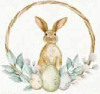
BRUNCH WITH THE BUNNY

Bunny Brunch Buffet on Saturday, April 4th from 11a - 2p - The Lounge and Bar will be open @ 11a.