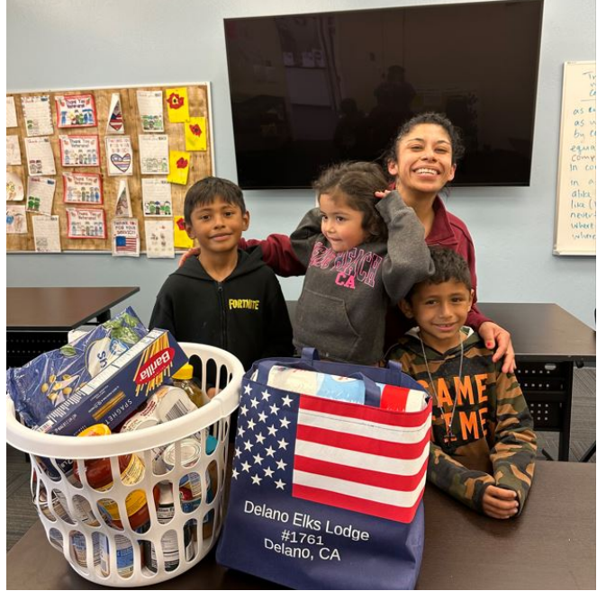
Delano, Calif., Lodge No. 1761 used a Spotlight Grant to provide food, essential needs, and support to families living in households that are under-resourced.

The Spotlight Grant has expanded the hunger relief project plan to include essential needs . Essential needs include items crucial for maintaining basic health, hygiene, and well-being, including many supplies not covered by government benefits such as SNAP . See below for examples on what are considered essential needs items.