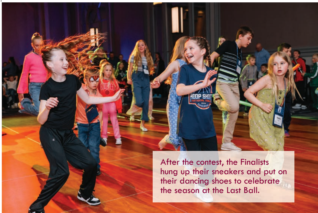
After the contest, the Finalists hung up their sneakers and put on their dancing shoes to celebrate the season at the Last Ball.