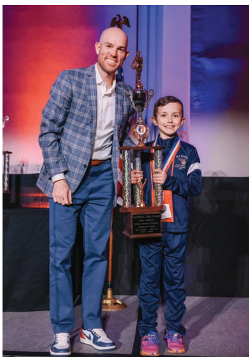
The top three Finalists in each division received trophies presented by the 2025 Keynote Speaker Robbie Gould, 18-year NFL veteran, including 11 years with the Chicago Bears.