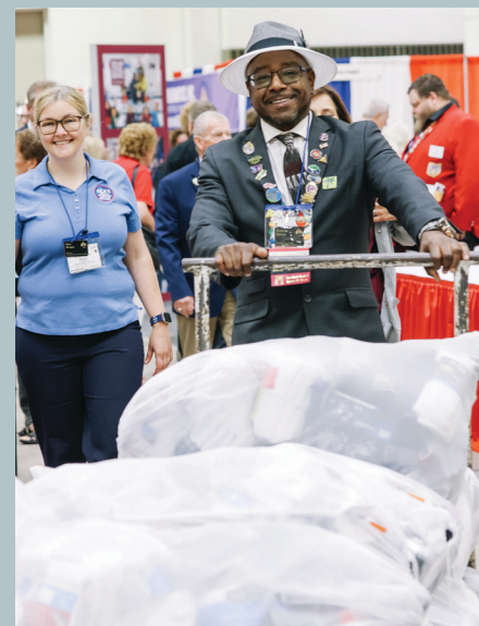
Elks were so generous that this picture only shows sock collection from one day at the Convention.

These two Weigel recipients discovered their “why” for going to medical school while they were giving back to their communities and touching the lives of others. Though the “whys” are different and they had different paths to find them, one thing is certainly the same: the values of Elkdom shine through in Elks scholars.