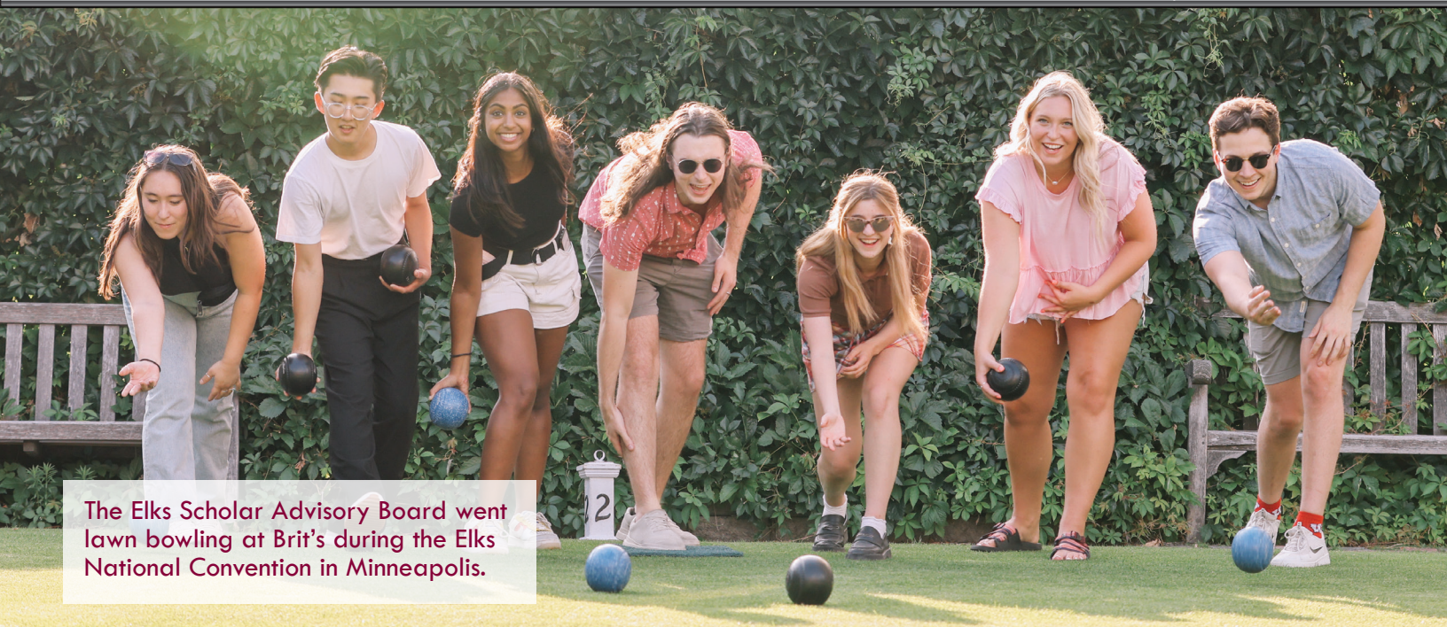
The Elks Scholar Advisory Board went lawn bowling at Brit's during the Elks National Convention in Minneapolis.