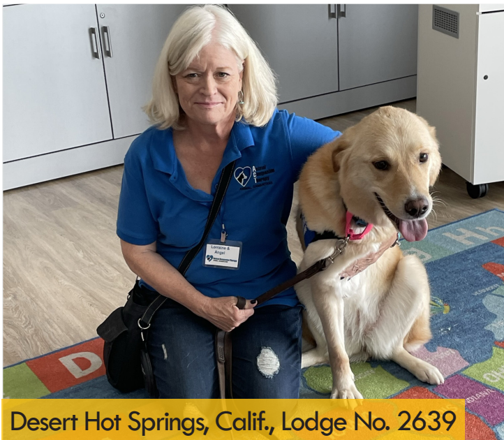
Desert Hot Springs, Calif., Lodge No. 2639