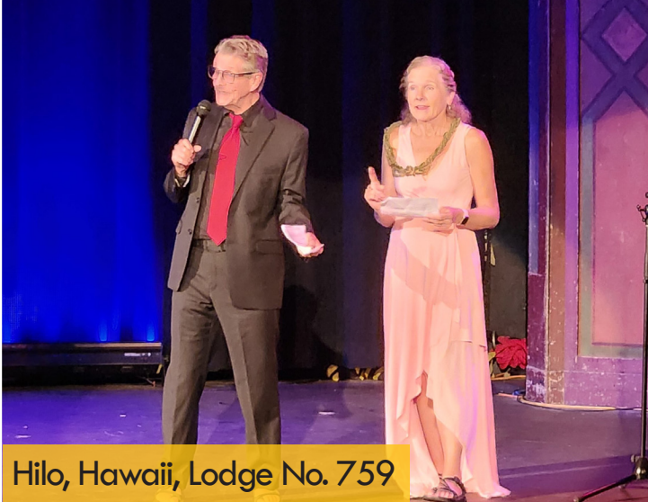
Hilo, Hawaii, Lodge No. 759