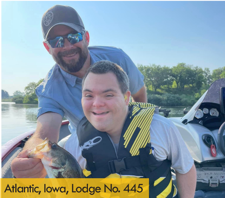
Atlantic, Iowa, Lodge No. 445