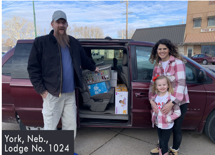
York, Neb., Lodge No. 1024

Access to books is an important factor in children's literacy, yet in many of the same under-resourced communities where the need for infant supplies is high, so is the need for books. Research shows that in under-resourced communities, there is an average of one book per 300 children. This is in stark contrast to middle-income communities, where, on average, there are 13 books in a single home.