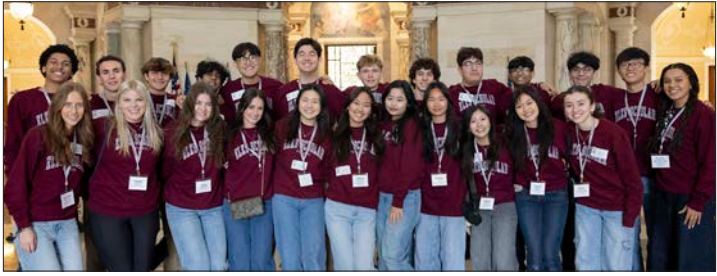
The Top 20 Most Valuable Student scholars traveled to Chicago and visited the Elks National Memorial building in May.

"Coming here and listening to your stories and getting