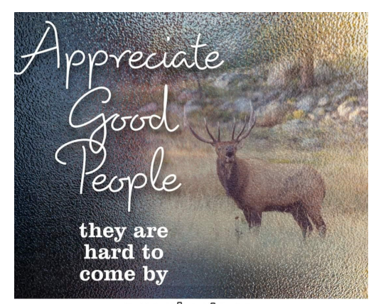
remember to say