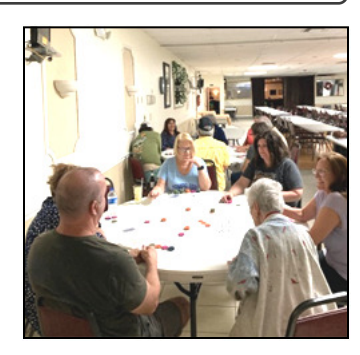
Poker Night with 22 players! Had to move into the dining room because we had so many people.