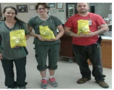
Wakefield nursing home received "goodie bags" for 32 residents. Pictured are some of the staff members.