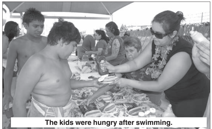
The kids were hungry after swimming.