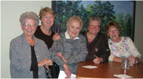
A Sunday afternoon.