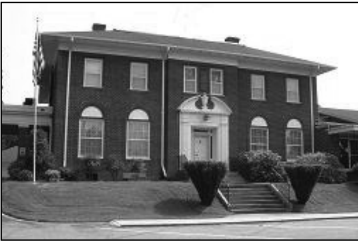
Happy Holidays from the North Wilkesboro Elks Lodge