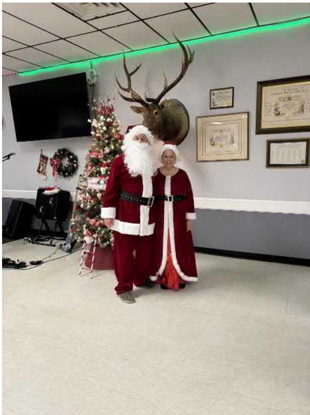
To the Left: The Veterans Christmas Party with Mr. and Mrs. Claus