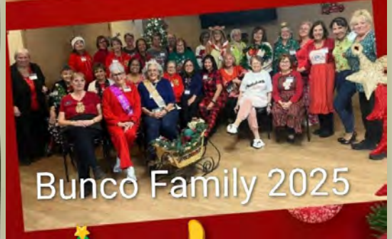
Bunco Family 2025

LADIES' BUNCO GAME NIGHT RAISES MONEY TO SUPPORT CLOTHE-A-CHILD PROGRAM