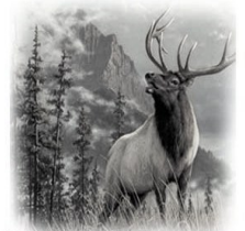
Elks Care - Elks Share

It brings peace from all the noise, A hope for a future, full of joys. But let us not forget the past, And learn from it, to make it last.