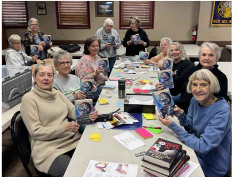
9 to 5'ers Tuesday Group