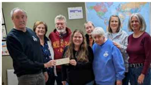
$2,000 Clive Food Pantry