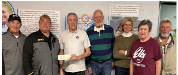
$2,000 St. Vincent de Paul