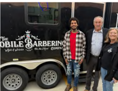
Mobile Barbering Co