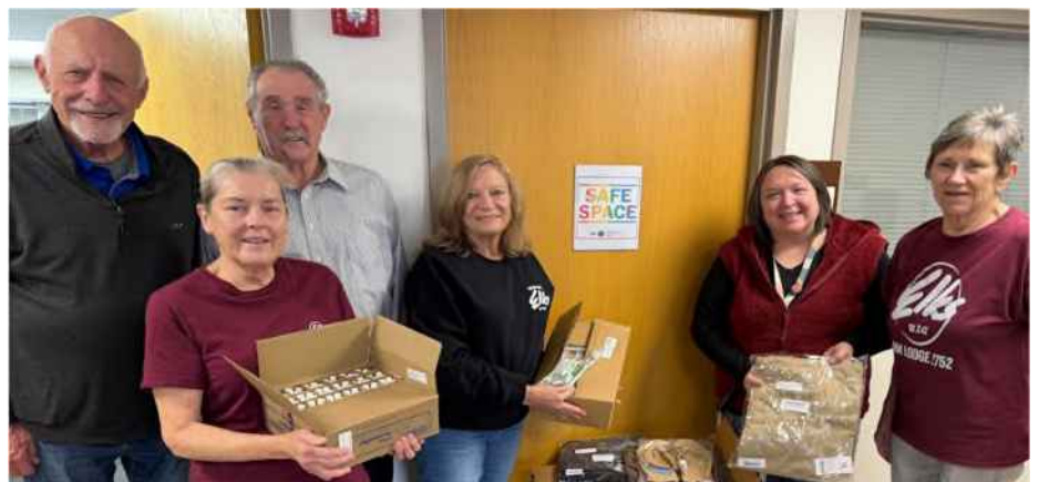
CRRC (Community Resource Referral Center) $1,300 of purchased items for homeless Veterans.