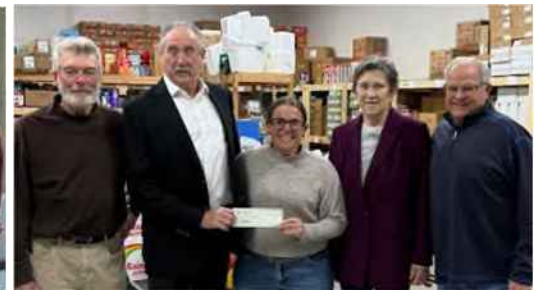
$2,000 Urbandale Food Pantry