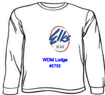
Illustration Only. For actual design see garments in the Club Room!

Come to the Lodge and check out our NEW T-Shirts. All sizes! $10 each.