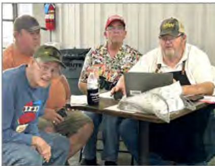
Above: Tally Team hard at work on Saturday.