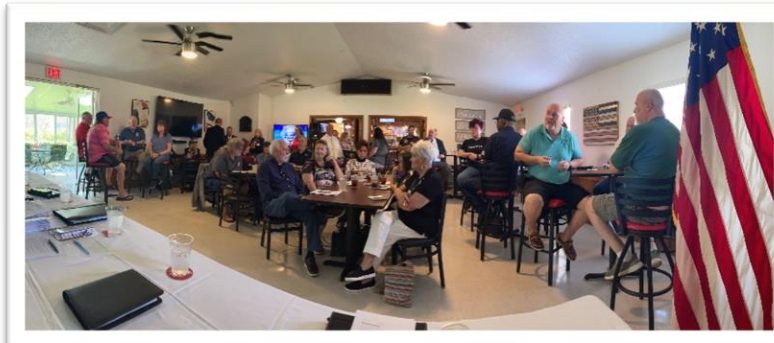
Metro District Members attending the DDGER and VP Clinics on April 13 th