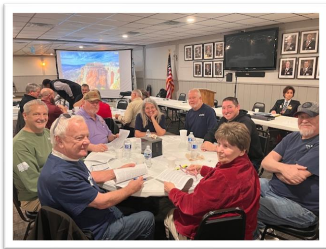
Afton Elks Lodge Members attending the Officer Training