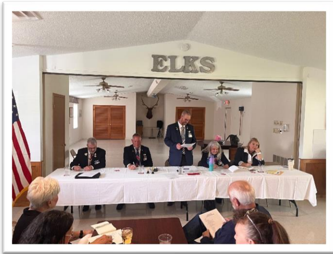
Vice President Entourage