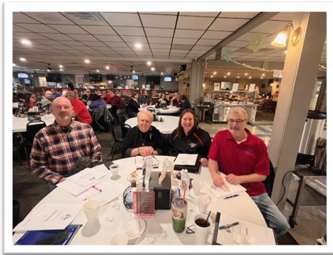
Ellisville Elks Lodge Members attending the Officer Training