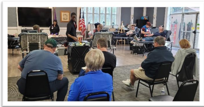
Elks #9 Lodge – Blood Drive 4-29-25