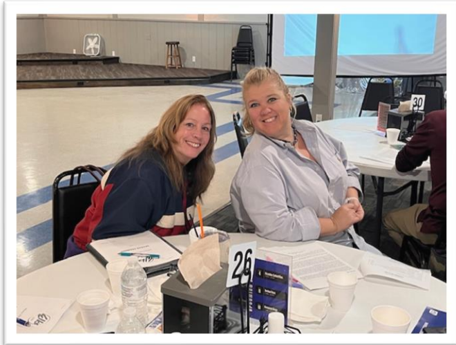
Manchester Lodge Members attending the Officer Training