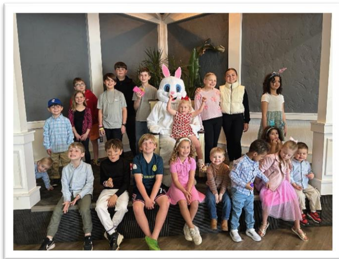
Elks #9 Lodge – Donuts with the Bunny 4-20-25

Stop by the Florissant lodge today and get your tickets for the 60th Anniversary party/ Inaugural Ball. Tickets are available behind the bar. While you are there be sure to pick up one of our new 60th Anniversary pins for $5.00.