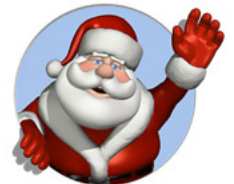
Welcome to the Elks