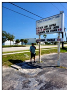
Lodge 2139 Marathon, FL