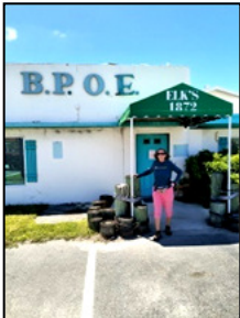
Lodge 1872 Sidney, MT

You can tell the weather is getting nice because our Elks are wandering more !!