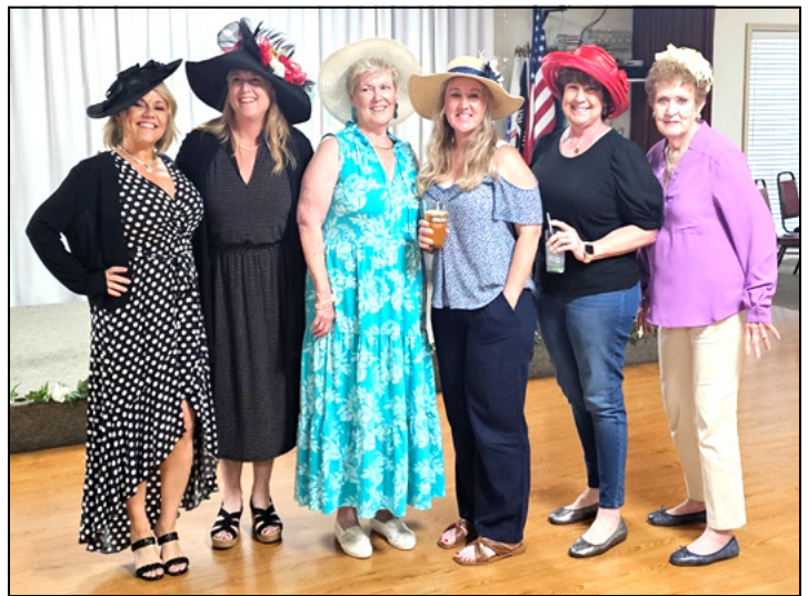
Our Card Players