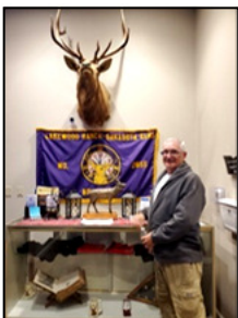
Lodge 1872 Sarasota, FL