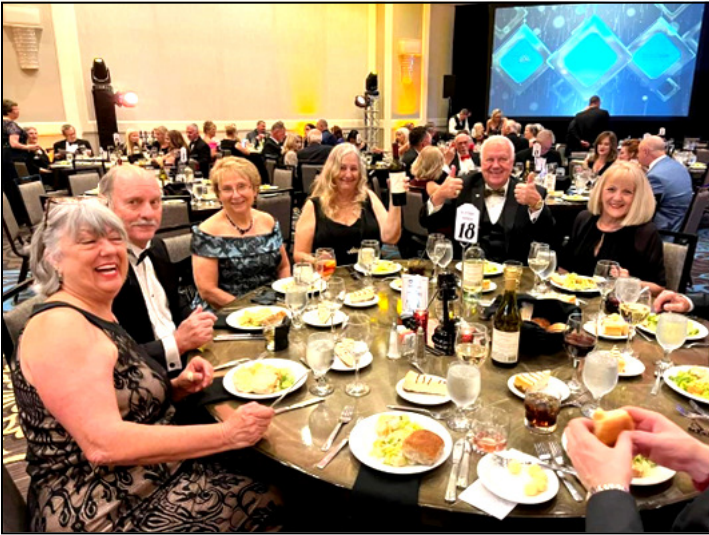
DOES Fashion Show