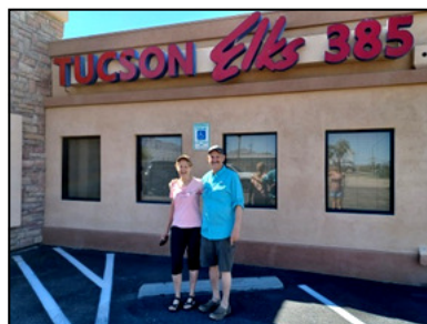
Lodge 385 Tucson, AZ