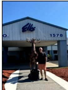
Lodge 1578 Tavares (Eustis), FL