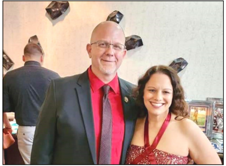
Kentucky Derby Day