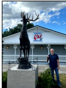
Lodge 2422 Apopka, FL