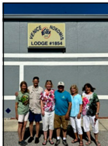
Lodge 2422 Venice-Nokomos, FL