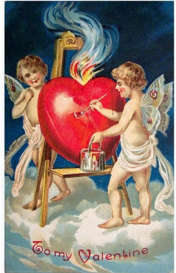
A Valentine's card, c. 1909