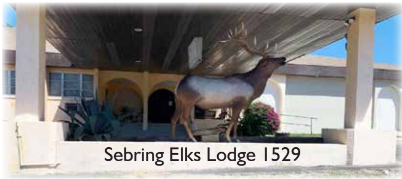
Sebring Elks Lodge 1529

PUBLISHED MONTHLY FOR SEBRING ELKS LODGE 1529 2618 KENILWORTH BLVD. • SEBRING, FLORIDA 33870