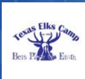
Texas Elks Camp

Click Squares Above to Visit Their Website