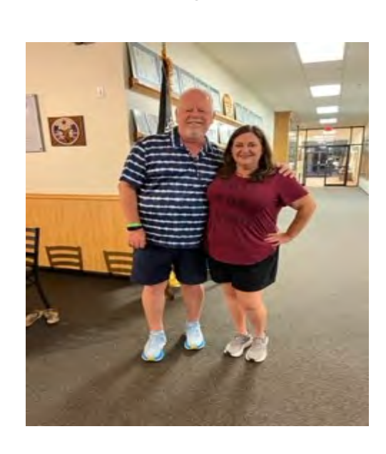
Line Dancing Party