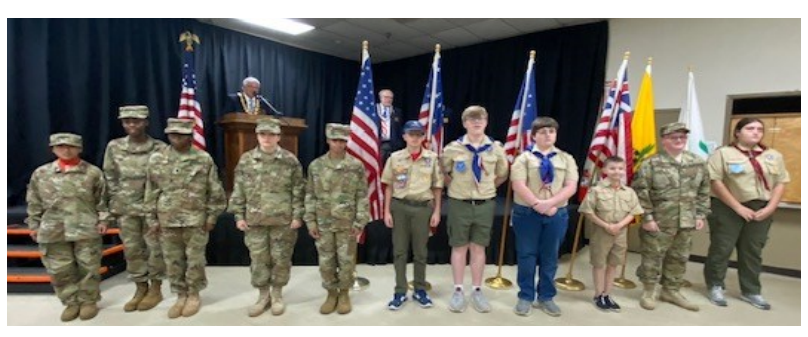
Scouts Troop 142 and Austin ROTC