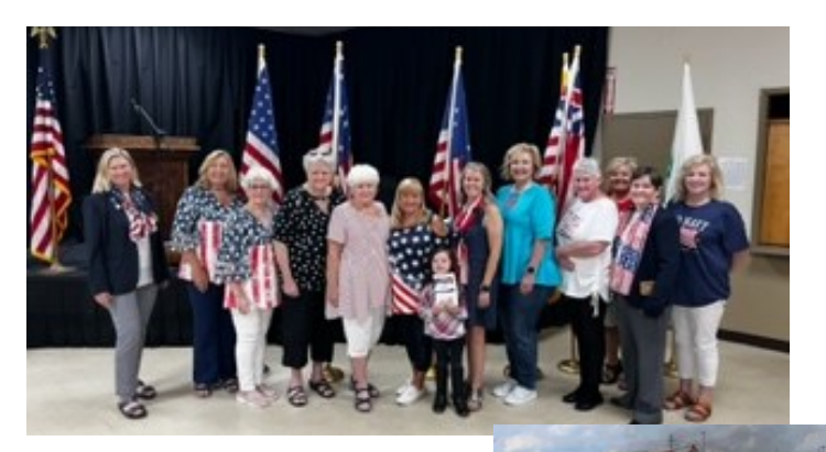
Decatur Emblem #127