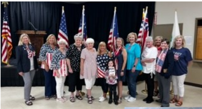
Decatur Emblem #127