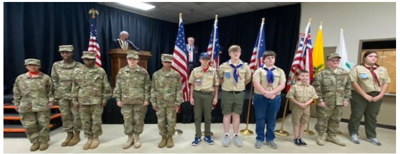
Scouts Troop 142 and Austin ROTC