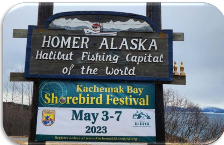
Hurray....Just in time for the Festival