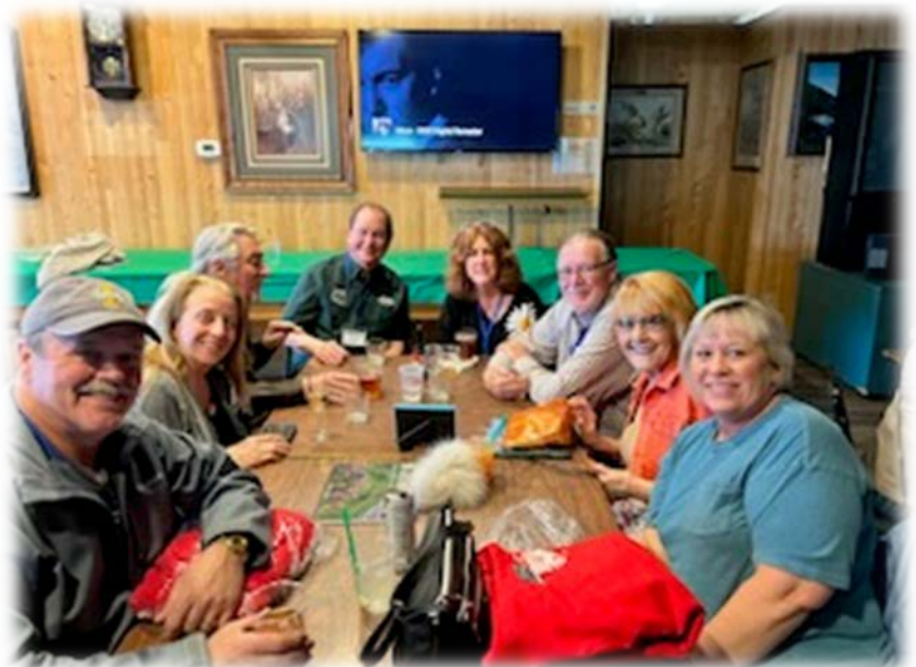
A portion of the Homer contingent