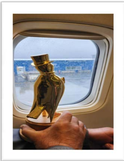
The journey begins. Who's afraid of flying? Goodbye Kodiak