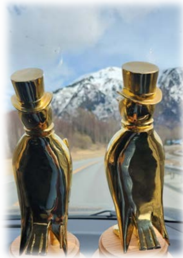
Birds of a feather. Homer & Kodiak birds head to Homer.