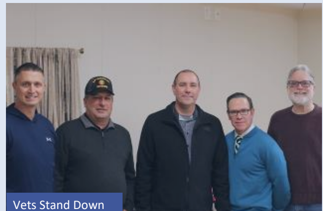
Vets Stand Down