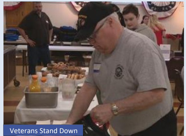
Veterans Stand Down