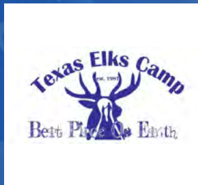
Texas Elks Camp