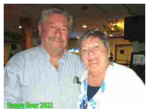
Happy Hour 2022