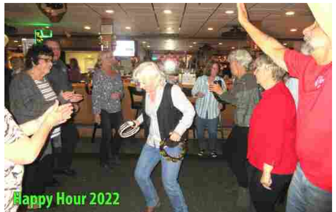
Happy Hour 2022