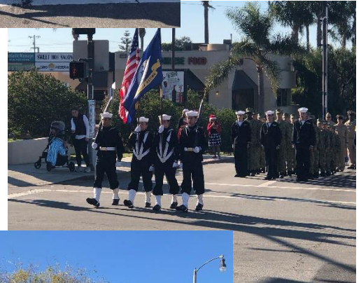
USN So. Bay Coastal Sea Cadet Corps