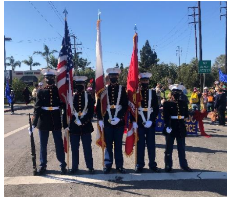
Honor Guard and kicking off the Parade were members of the Redondo Union HS Marine Corps ROTC

On December 12, Members of the Redondo Beach Elks Lodge, the Redondo Beach Veterans Task Force, the USN - South Bay Coastal Division Sea Cadet Corps, and the Redondo Union HS Marine Corps ROTC participated in the El Segundo Christmas Parade. You can say that Redondo Beach was well represented in their Annual Parade.