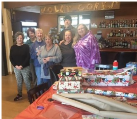
The Wrapping Crew