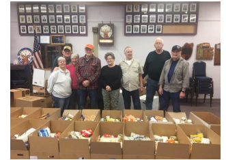
The Food Packaging Crew