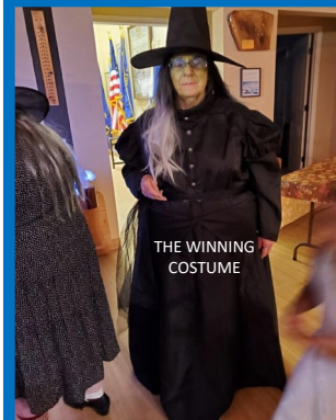
THE WINNING COSTUME