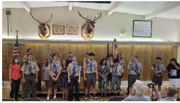
Proud Parents and New Eagle Scouts