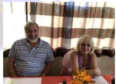
Happy Customers at the Dinner.