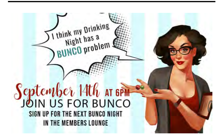
September 14<sup>th</sup> - Bunco Night Sign-up sheet is in the Members Lounge

Veteran's Breakfast – September 12<sup>th</sup> Eggs/Omelet bar, Potatoes, Bacon, Sausage, French toast, Pancakes, Biscuits and Gravy 8:30 to 11:00am Adults $10.00 Veterans & Kids $8.00