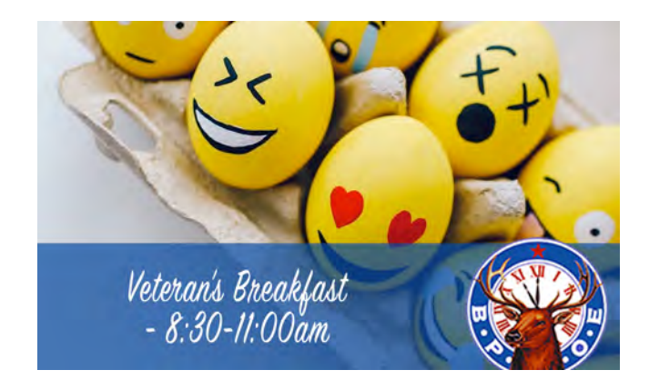
Upcoming events – cont.

Veteran's Breakfast – September 12<sup>th</sup> Eggs/Omelet bar, Potatoes, Bacon, Sausage, French toast, Pancakes, Biscuits and Gravy 8:30 to 11:00am Adults $10.00 Veterans & Kids $8.00