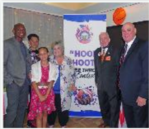
ABOVE AND LEFT, PHOTOS FROM NIGHT'S ACTIVITIES