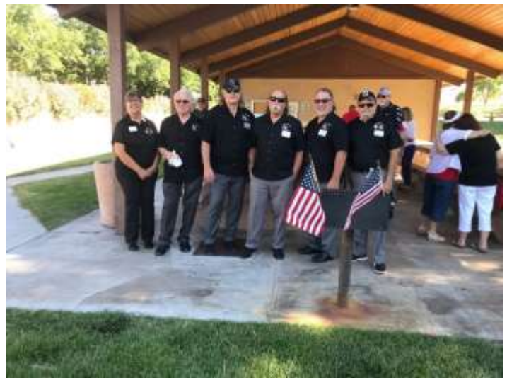
Veterans Day with the lodge officers at the Veterans Memorial Park, with a very good turnout.