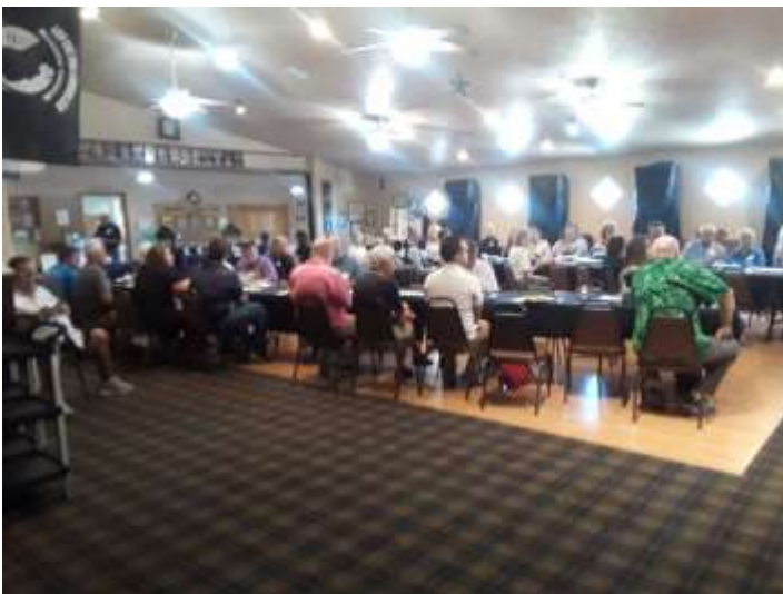
Chamber of Commerce Breakfast Meeting, another good turnout.