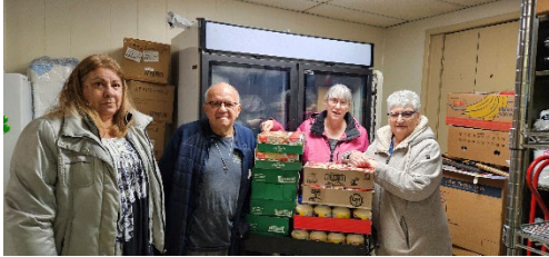
Members delivering food to the Senior Lunch Program

ENF supports many things such as hoop shoot, scholarships, and grants, of which Newark has received many to benefit our community. Newark had 5 youth participate in the District Hoop Shoot and 2 will go on to a regional competition. We made another grocery shopping trip to fill the shelves of the food closet and food for the Senior Lunch Program. Your yearly donations to ENF make these grants possible.